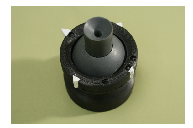
Fig. 2. The base of the joystick device. The probe is inserted into the hole on top of the small cylinder and can be tilted with two degrees of freedom. Pressing the probe down to click causes the small cylinder to move into the ball while still permitting the probe to be tilted.

and reassembled in the operating room prior to the operation. Assembly and disassembly take at most a minute each.