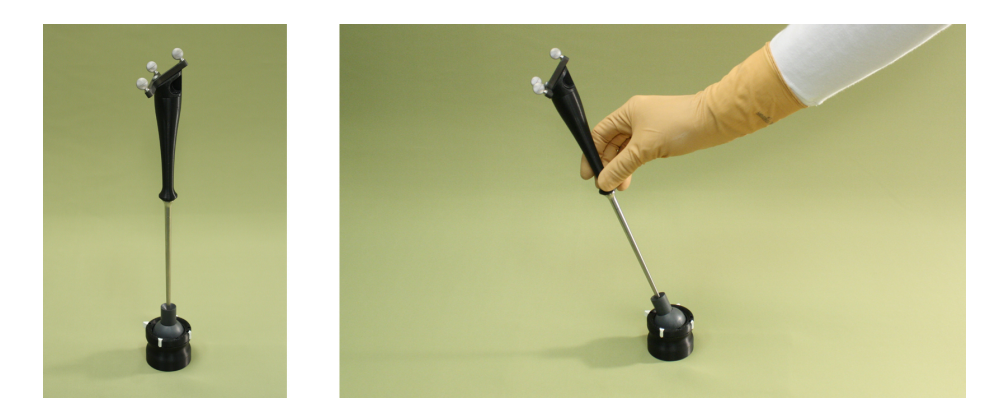
Fig. 1. The input device is activated when a tracked surgical probe is inserted into the base. Force feedback returns the probe to center and permits clicking.

New technology usually has slow acceptance in the operating room, in part due to human factors limitations [4]. A new device can require a substantial training period for both the surgeon and staff.